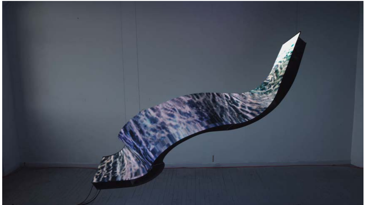
Chasing Waterfalls , Collectif Hidden Edges (Myriam Bleau & Lucas Paris, Cinzia Campolese, Emma Forgues, Baron Lanteigne), 2023 © Lucas Paris (Twisted LED screen, 3,2 meters long)